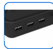
Built-in 3-Port Hub