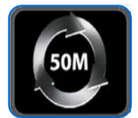
50 Million Keystrokes