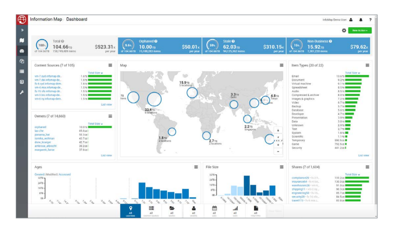
Figure 2. Veritas Information Map integration renders your information environment in visual context and guides users towards unbiased, informationgovernance decision making.

Backup Exec's integration with Veritas<sup>™</sup> Information Map renders your information environment in visual context and guides users towards unbiased, information-governance decision making. Using the Information Map's dynamic navigation, customers can identify areas of risk, areas of value and areas of waste across their storage environment and make decisions which help reduce information risk and optimize information storage.