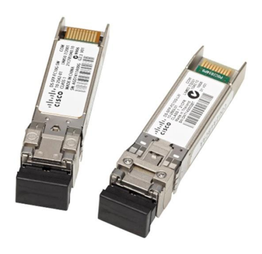
Figure 4. Cisco 10-Gbps Fibre Channel SFP+ Modules

Cisco 10-Gbps Fibre Channel SFP+ modules (Figure 4) provide Fibre Channel connectivity for the 10-Gbps Fibre Channel ports on the MDS 9000 Family platform. Two types are available: the Cisco Fibre Channel Shortwave SFP+ (part number DS-SFP-FC10G-SW) and the Cisco Fibre Channel Longwave SFP+ (part number DS-SFP-FC10G-LW).