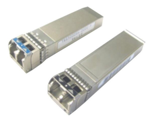
Figure 3. Cisco 8-Gbps Fibre Channel SFP+ Modules

Cisco 8-Gbps Fibre Channel SFP+ modules (Figure 3) provide Fibre Channel connectivity for the 2/4/8-Gbps ports on the MDS 9000 Family platform. Three types are available: the Cisco Fibre Channel Shortwave SFP+ (part number DS-SFP-FC8G-SW), the Cisco Fibre Channel Longwave SFP+ (part number DS-SFP-FC8G-LW), and the Cisco Fibre Channel Extended Reach SFP+ (part number DS-SFP-FC8G-ER). Each offers 2/4/8-Gbps autosensing Fibre Channel connectivity.