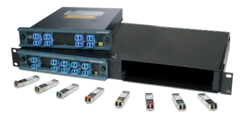
Figure 13. Cisco CWDM Extended Distance SFP Solution

The CWDM SFP solution enables the transport of up to eight channels over one pair of single-mode fiber strands, enabling enterprises to increase the bandwidth of an existing optical infrastructure without adding new fiber strands. The solution can be used in parallel with other Cisco SFP devices on the same platform.