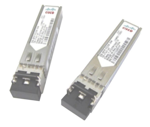
Figure 1. Cisco 2-Gbps Fibre Channel SFP Modules

Cisco 2-Gbps Fibre Channel SFP modules (Figure 1) provide cost-effective Fibre Channel connectivity for MDS 9000 Family Fibre Channel switching modules. Two types are available: the Cisco Fibre Channel Shortwave SFP (part number DS-SFP-FC-2G-SW) and the Cisco Fibre Channel Longwave SFP (part number DS-SFP-FC-2G-LW). Each offers 1/2-Gbps autosensing Fibre Channel connectivity.