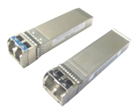
Figure 11. Cisco 16-Gbps Fibre Channel SFP+ Transceivers

The Cisco 16-Gbps Fibre Channel SFP+ Transceivers (Figure 11) provide Fibre Channel connectivity for 4/8/16-Gbps ports on the MDS 9000 Family platform. Three types are available: the Cisco Fibre Channel Shortwave SFP+ (part number DS-SFP-FC16G-SW), the Cisco Fibre Channel Longwave SFP+ (part number DS-SFP-FC16G-LW), and the Cisco Fibre Channel Extended Longwave SFP+ (part number DS-SFP-FC16GELW). Each offers 4/8/16-Gbps autosensing Fibre Channel connectivity.