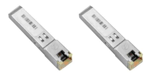
Figure 8. Cisco Copper Gigabit Ethernet SFP Modules

For even more cabling flexibility, the MDS 9000 Family offers copper Gigabit Ethernet SFP modules. Based on the 1000BASE-T standard, Cisco Copper Gigabit Ethernet SFP modules (Figure 8) provide cost-effective connectivity for data center applications. Cisco Copper Gigabit Ethernet SFP modules (part number DS-SFP-GE-T) allow the use of standard Category 5 unshielded twisted pair (UTP) cabling for Ethernet connectivity.