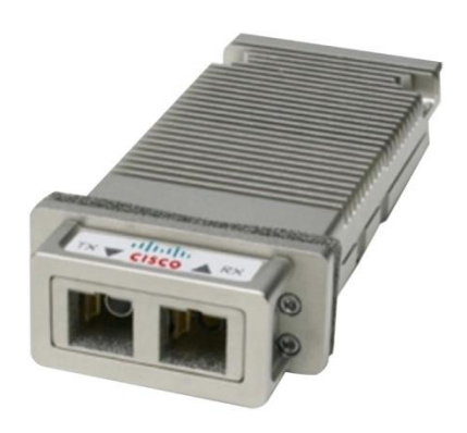
Figure 12. Cisco 10-Gbps Ethernet X2 Transceiver