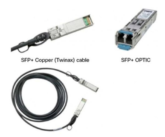
Figure 5. Cisco 10GBASE SFP+ Modules

Cisco 10-Gbps Ethernet SFP+ modules (Figure 5) provide 10-Gbps Ethernet connectivity for the Cisco MDS 9500 10-Gbps 8-Port FCoE Module and MDS 9250i Multiservice Fabric Switch.