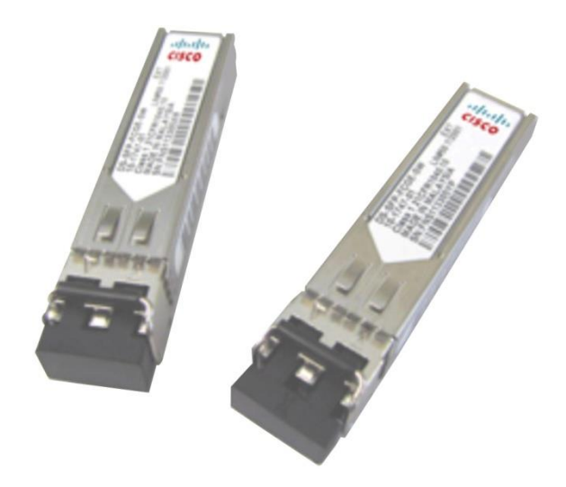
Figure 2. Cisco 4-Gbps Fibre Channel SFP Modules

Cisco 4-Gbps Fibre Channel SFP modules (Figure 2) provide cost-effective Fibre Channel connectivity for 1/2/4-Gbps ports on the MDS 9000 Family platform. Three types are available: the Cisco Fibre Channel Shortwave SFP (part number DS-SFP-FC4G-SW), the Cisco 4-km Fibre Channel Longwave SFP (part number DS-SFP-FC4G-MR), and the Cisco 10-km Fibre Channel Longwave SFP (part number DS-SFP-FC4G-LW). Each offers 1/2/4-Gbps autosensing Fibre Channel connectivity.