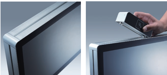
Side groove design for Flexible peripheral device