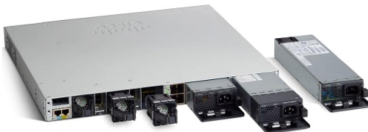
Figure 3. Cisco Catalyst 9300 Series Dual Redundant Power Supplies

The Cisco Catalyst 9300 Series Switches support dual redundant power supplies. The switches ship with one power supply by default, and the second power supply can be purchased when the switch is ordered or at a later time. If only one power supply is installed, it should always be in power supply bay #1. The switches also ship with three field-replaceable fans.