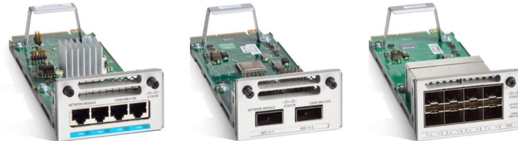
Table 2. Network Module Numbers and Descriptions