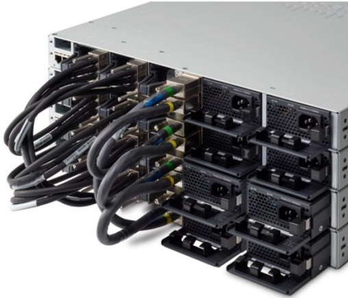
Figure 4. Cisco Catalyst 9300 Series StackPower