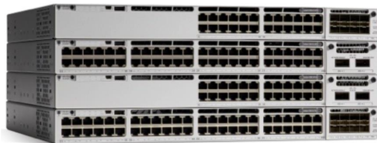
Figure 1. Cisco Catalyst 9300 Series Switches

Table 1 lists port scale and power details for the Cisco Catalyst 9300 Series models.