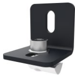
VWA-01/ VWA-02/ VWA-03