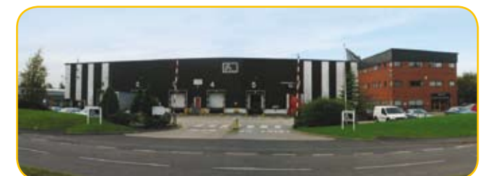
Preston site, UK