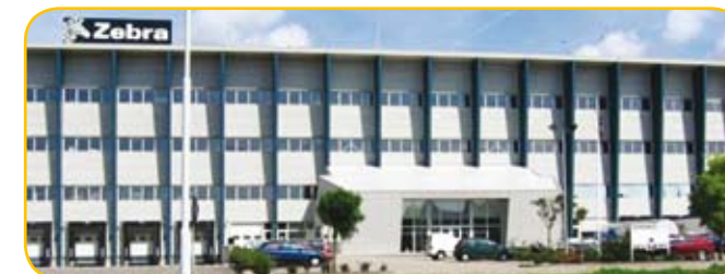
Heerenveen site, the Netherlands

Zebra is one of Europe's largest label converters, with converting sites both in the UK and the Netherlands.